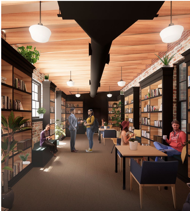
Reading Room Rendering